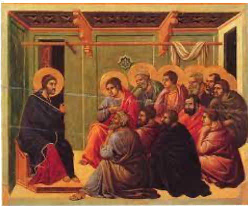
Christ taking leave of the Apostles (Duccio 1260 – 1318)