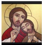
Beloved Disciples Spirituality for the Autumn of Life

To see the fuller details please go to the parish website 'Parish Newsletter'