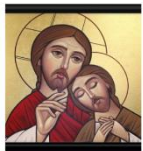
Beloved Disciples Spirituality for the Autumn of Life

“Old age, is where wisdom is woven, which in turn illuminates the lives of younger generations and the entire community.” Pope Francis