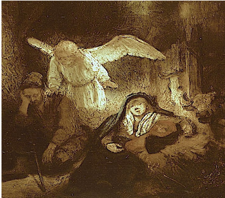
Rembrandt: "The Dream of St. Joseph" c. 1650-55