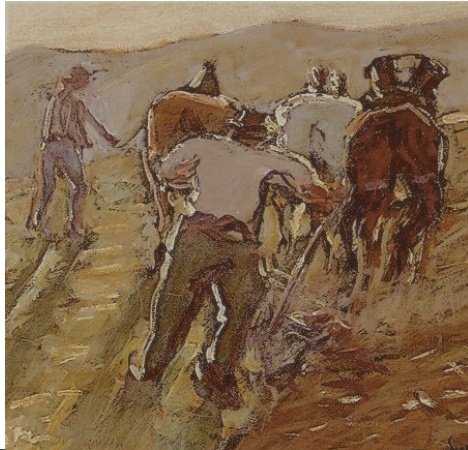
Ploughing: Rene Auguste Seyssaud