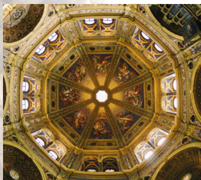
CIVIC TEMPLE OF THE INCORONATA