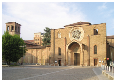
CHURCH OF ST. FRANCIS OF ASSISI