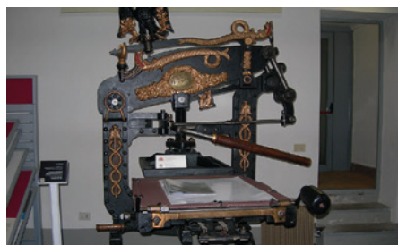
MUSEUM OF PRESS AND ART PRINTING