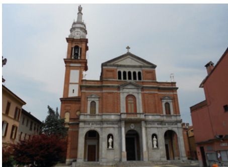
BASILICA OF ST. FRANCESCA CABRINI · S. ANGELO LOD.