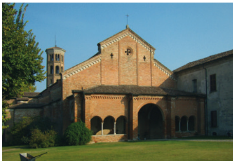
CISTERCIAN ABBEY · ABBADIA CERRETO