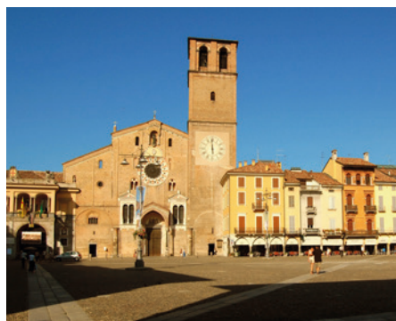
CATHEDRAL · ASSUMPTION OF MARY