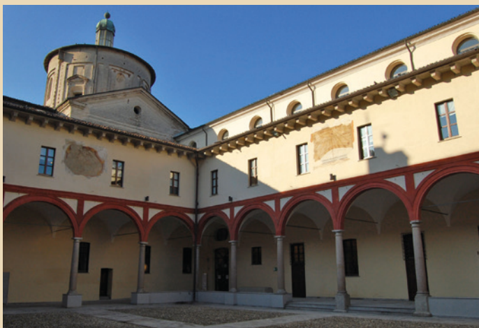
FORMER CONVENT OF S. CHRISTOPHER (CURRENT HEADQUARTER OF THE PROVINCE OF LODI)