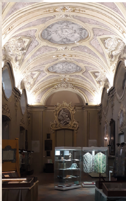
DIOCESAN MUSEUM OF SACRED ART