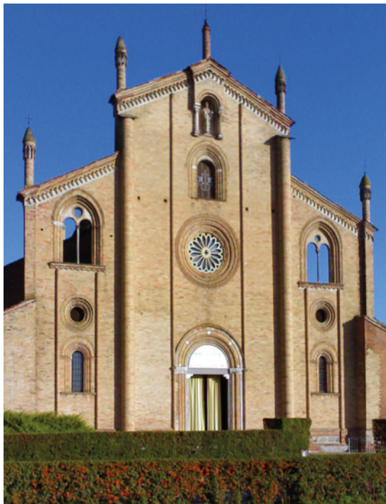
BASILICA OF THE TWELVE APOSTLES - LODI VECCHIO