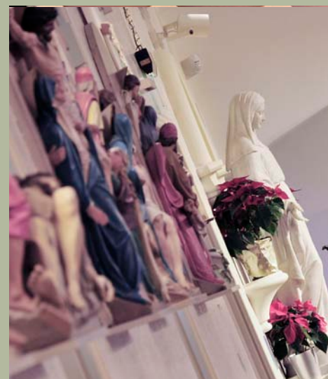
PHASE 2 REDEVELOPMENT PROGRAMME